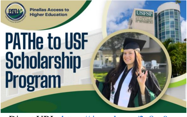
Direct URL: https://tinyurl.com/2p8ys9vx

The Pinellas Access to High Education (PATHe) program aims to provide equitable, flexible and attainable pathways to higher education for all students in Pinellas County. Their new scholarship provides students who recently graduated from high school in Pinellas County and were admitted to USF St. Peteresburg the opportunity to earn additional funds for college-related expenses; The deadline to apply is May 15. For more information about the application, please see the flyer below.