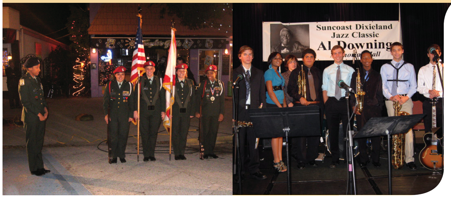
Boca Ciega High School