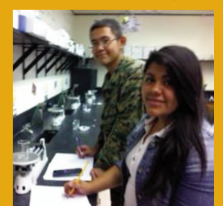
clearwater high school