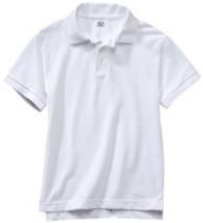
Boy's Short Sleeve Polo