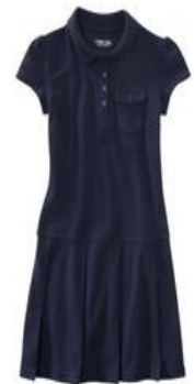
Girl's Tennis Dress