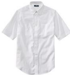
Full Button Shirt