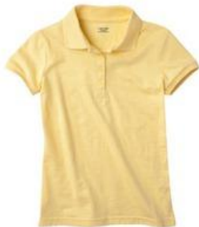
Girl's Short Sleeve Polo