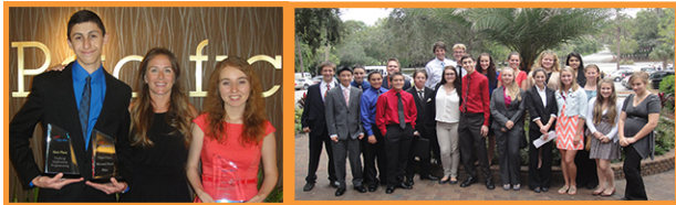
NLC National Winners

Future Business Leaders of America (FBLA) is the largest student business organization in the country with over 250,000 members. FBLA is the premiere student organization that aligns with all Warrior Academy courses. In Florida, FBLA functions as an integral part of the instructional program of the business education program in secondary schools.