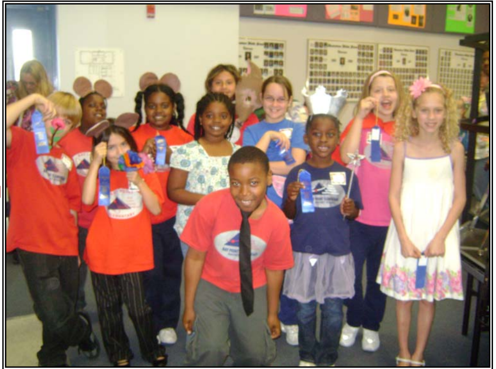
Club Olé students Elementary at the Annual Pinellas County World Languages International Day held at Meadowlawn Middle School