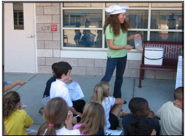
The Spanish Team illustrated how you turn a liquid into a solid—the result? Delicious ice cream!