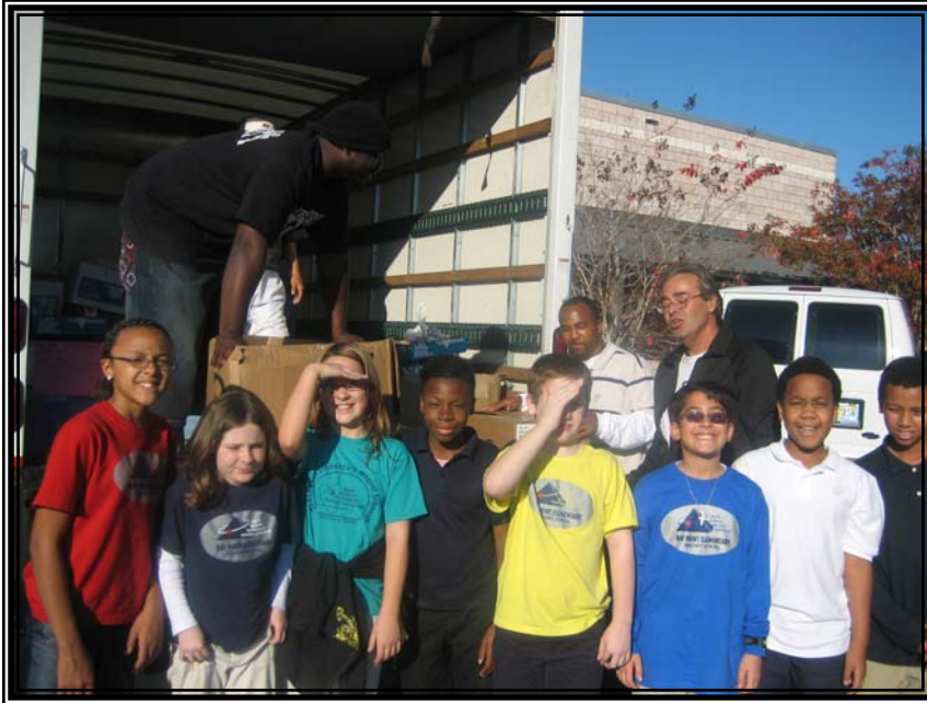
Students collected over 5,000 cans of food