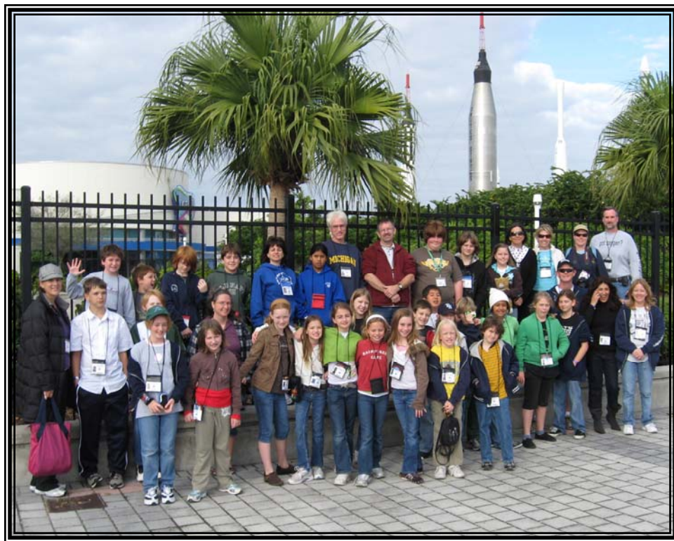
Young Astronauts at the Kennedy Space Center

On the same day that we had pick-up, so did other schools in our district. Well, the "pick-up people" were AMAZED at the amount of items we collected!! They kept on saying..."There's more?????" They said we were BY FAR the school that collected the most cans, estimating at about 5,000 plus items!!!!