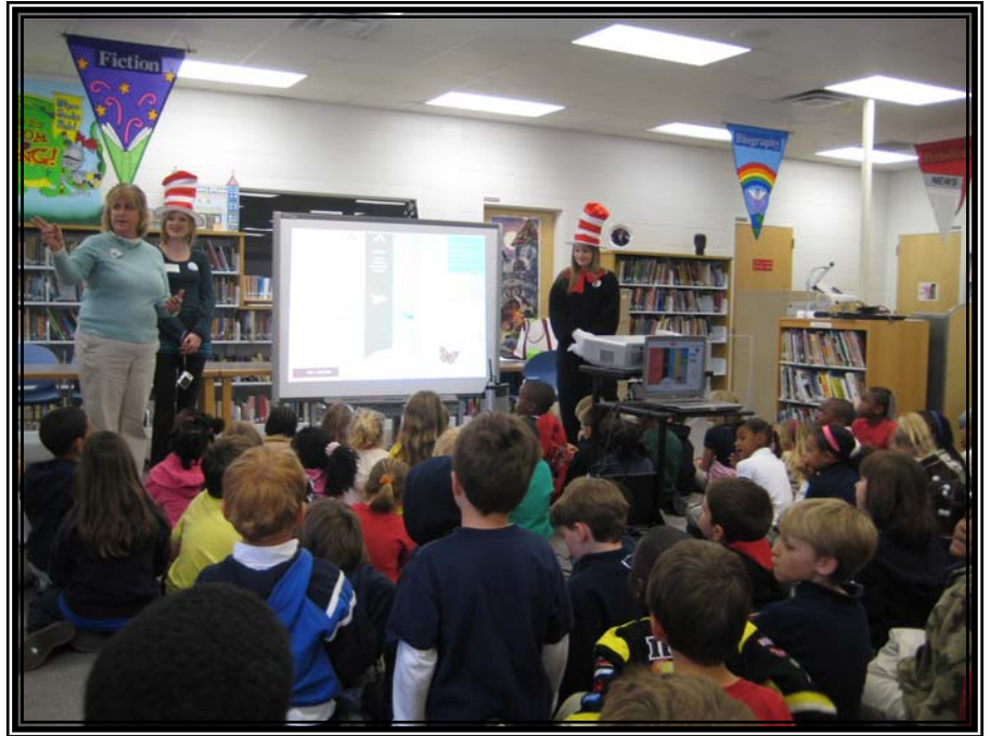
The Cat in the Hat (aka Sylvan Learning Center) was on hand to celebrate Dr. Seuss' Birthday.