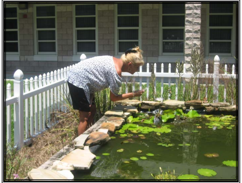
The campus is going green. Families can pitch in by using the paper and metal recycling bins at the north side of the school.