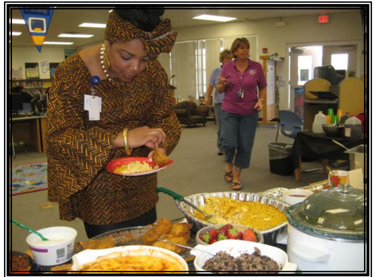
Staff members celebrated African American Authors Day with a soul food luncheon. Students read books written by African American authors.