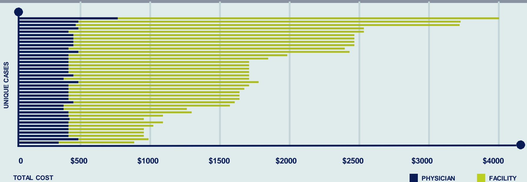
PRICE VARIABILITY FOR COLONOSCOPY (NO BIOPSY)