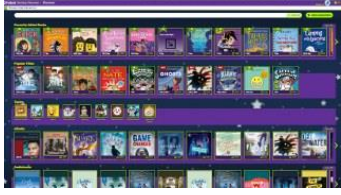
6. Destiny Discover