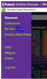
7. Click on My Stuff by clicking on the bars on the upper left of the screen