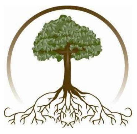
Strong Family roots!