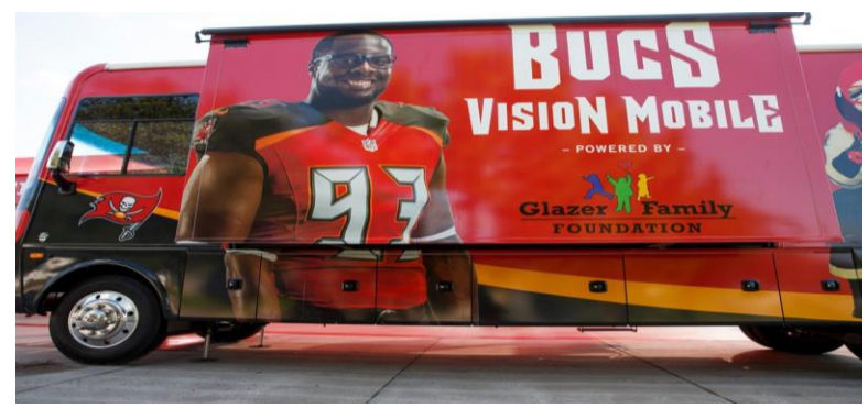
Glazer Children's Foundation Vision Van