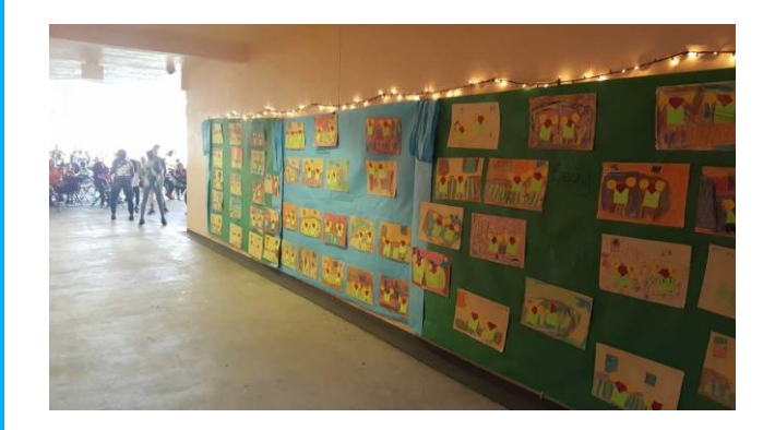
Evening of the Arts