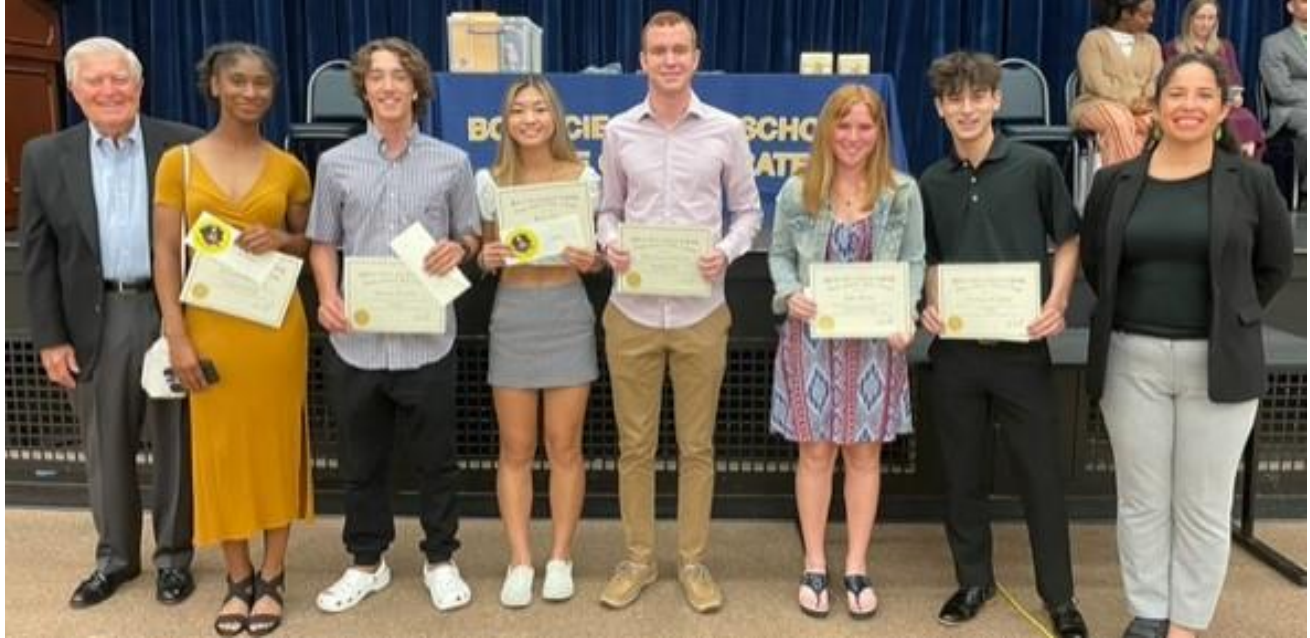
2022 Top Student Athletes and Scholarship Recipients

BCHS Pirate Athletic Hall of Fame, Inc. – Monday, April 3, 2023