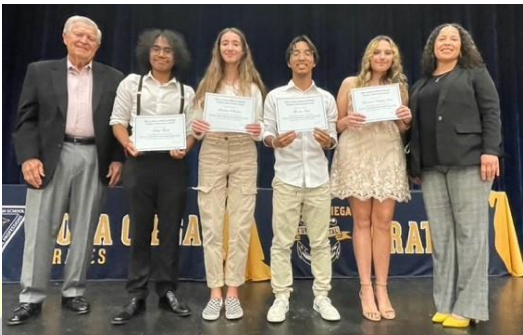
2023 Top Student Athletes and Scholarship Recipients

BCHS Pirate Athletic Hall of Fame, Inc. – Monday, April 29, 2024