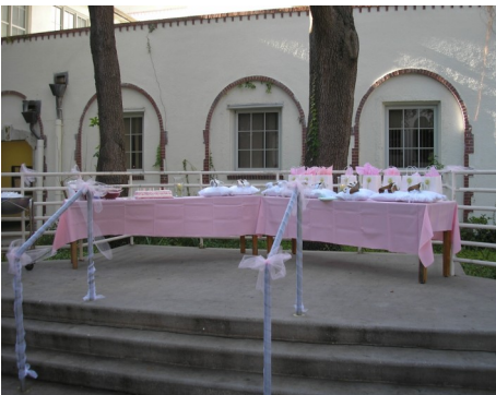
The table is set, and families and guests await the arrival of the “quinceañeras” and their “chambelanes”.