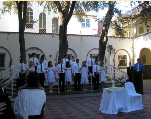
Las quinceañeras y los chambelanes