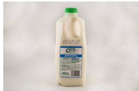
Front of product