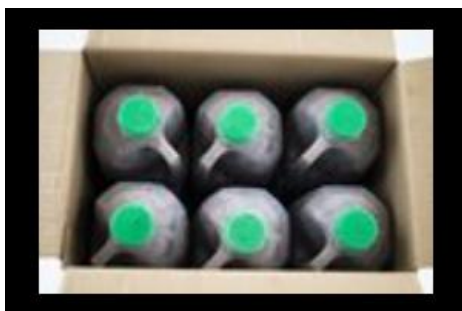
Case / box inside view