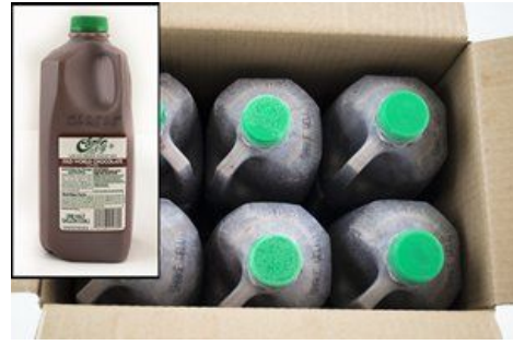
Additional product photos

General Mills Proprietary and Confidential information. All data is deemed accurate as of 12/11/2015. Please contact General Mills for the most recent product information.