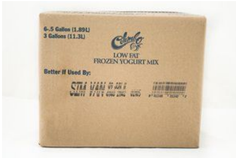
Case / box wide front side 1

Base Product Code: 21142000 14 Digit GTIN: 10041148211429 Product Description: Colombo®, Lowfat Frozen Yogurt, 0.5 gal, Simply Vanilla