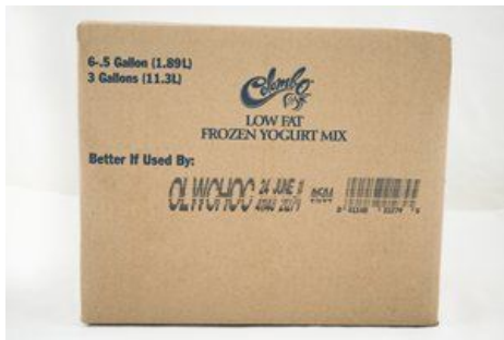
Case / box wide front side 1

Base Product Code: 21279000 14 Digit GTIN: 10041148212792 Product Description: Colombo®, Lowfat Frozen Yogurt, 0.5 gal, Old World Chocolate