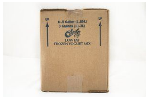
Case / box short side 2