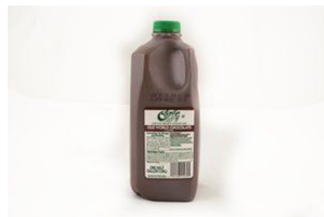
Front of product