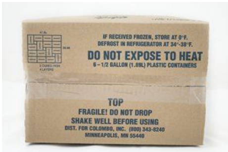
Case / box top