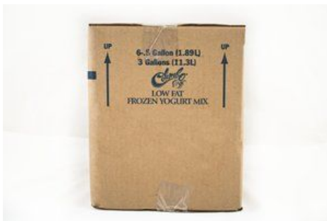
Case / box short side 1