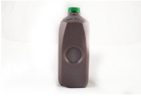
Back of product