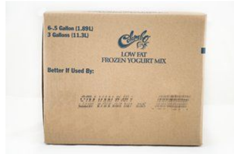
Case / box wide front side 2