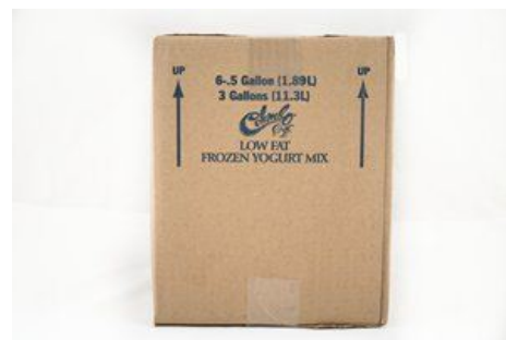
Case / box short side 2