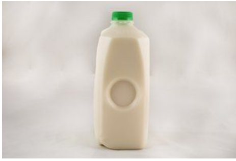
Back of product