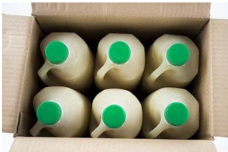
Case / box inside view