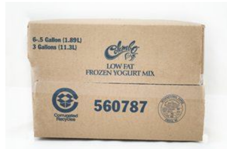
Case / box bottom