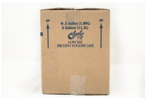
Case / box short side 1