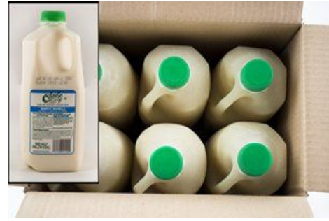
Additional product photos

General Mills Proprietary and Confidential information. All data is deemed accurate as of 12/11/2015. Please contact General Mills for the most recent product information.